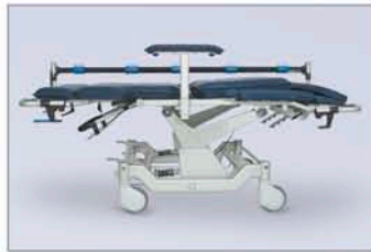
I-660 with accompanying Barton® PTS™ .