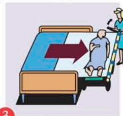
3 Transfer patient by turning handle.