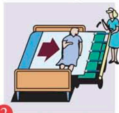
2 Attach sheet to the Barton® PTS™ .