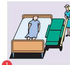
1 Place chair at bed side in horizontal position.